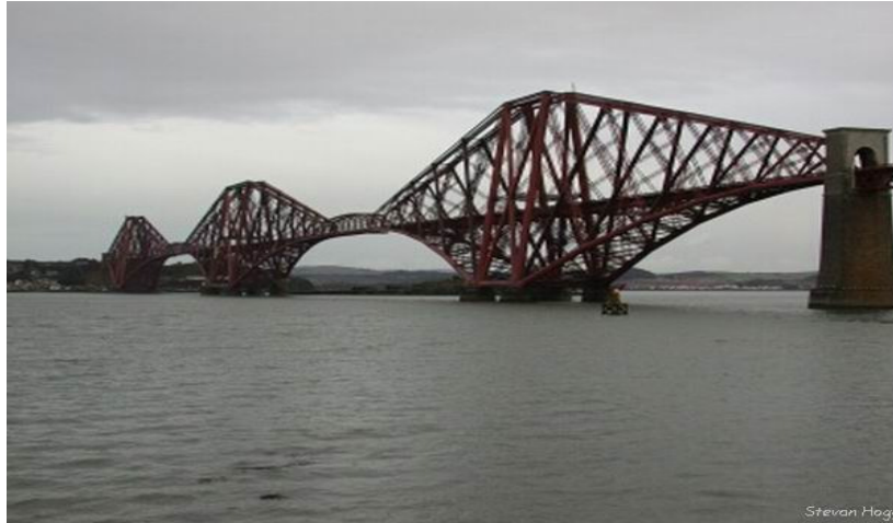
Forth Railway Bridge